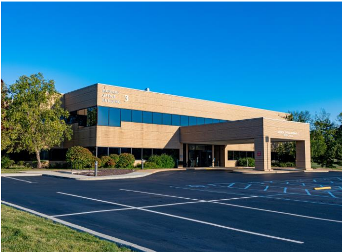
MEDICAL OFFICE BUILDING 3 • 1020 North Mason Road