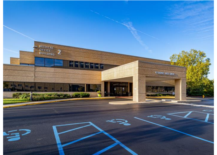
MEDICAL OFFICE BUILDING 2 • 10 Barnes West Drive