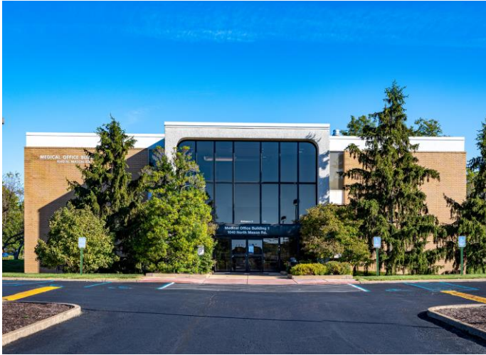
MEDICAL OFFICE BUILDING 1 • 1040 North Mason Road