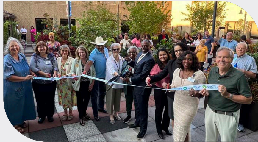
Christian Hospital team members, Auxilians, volunteers and community members gathered for the official opening of the Reflection Garden, which will feature commemorative pavers.