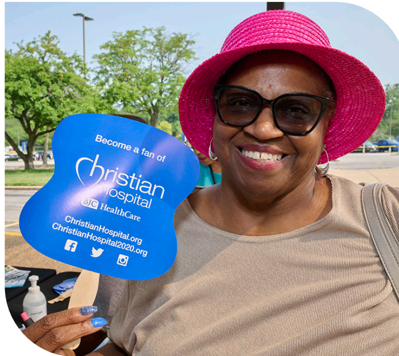
The community visited Christian Hospital for education and health care screenings at the hospital's free Health Expo.