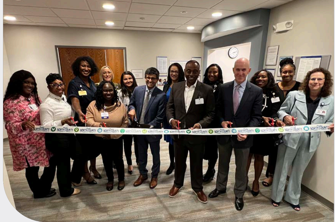
Christian Hospital Neurosurgery Center ribbon-cutting ceremony opens the door to more expertise close to home.