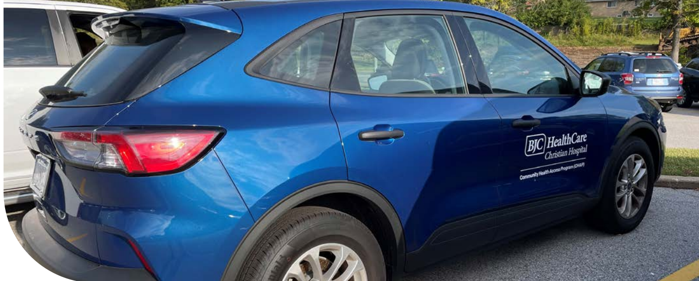
Christian Hospital Auxiliary purchased a car for the CHAP team’s home visits to patients.

This year, the Christian Hospital Auxiliary purchased a car branded with an identifying Christian Hospital logo for the CHAP team to use for their patient home visits. When people see Christian Hospital out